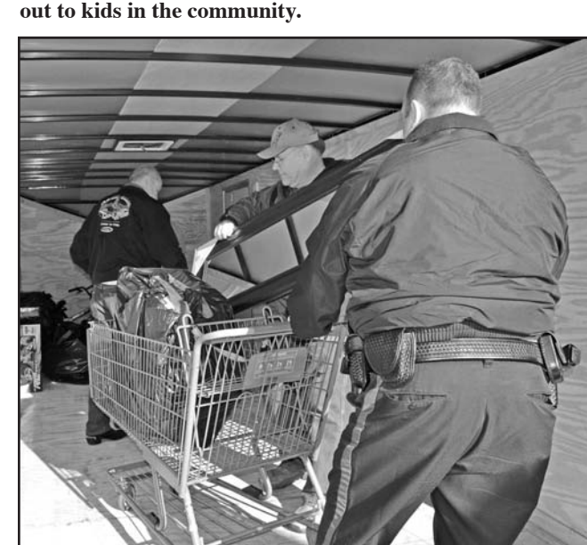
After the kids finish their shopping, volunteers load up the presents and transport them back to the middle school.