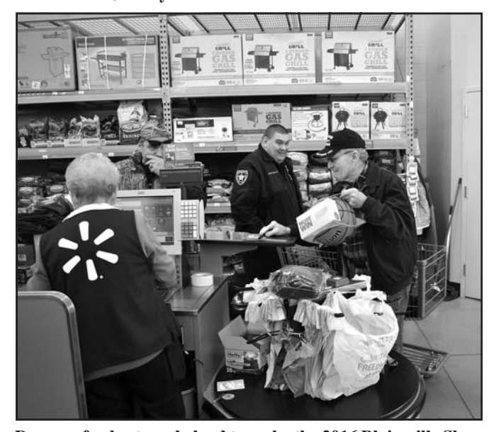
Dozens of volunteers helped to make the 2016 Blairsville Shop With A Cop a huge success.