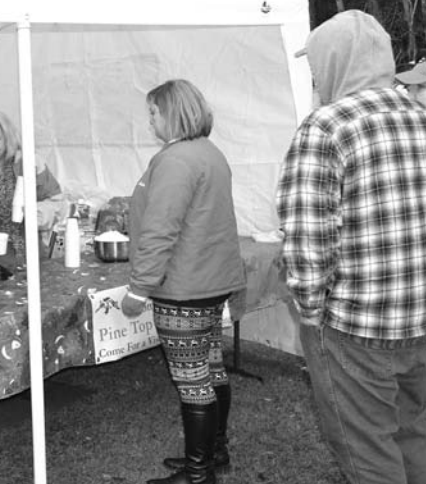
The good people of Pine Top Baptist Church supplied more than 500 cups of hot cocoa and cider at the Dec. 10 program. Ten other area churches pitched in to make the event extra special.